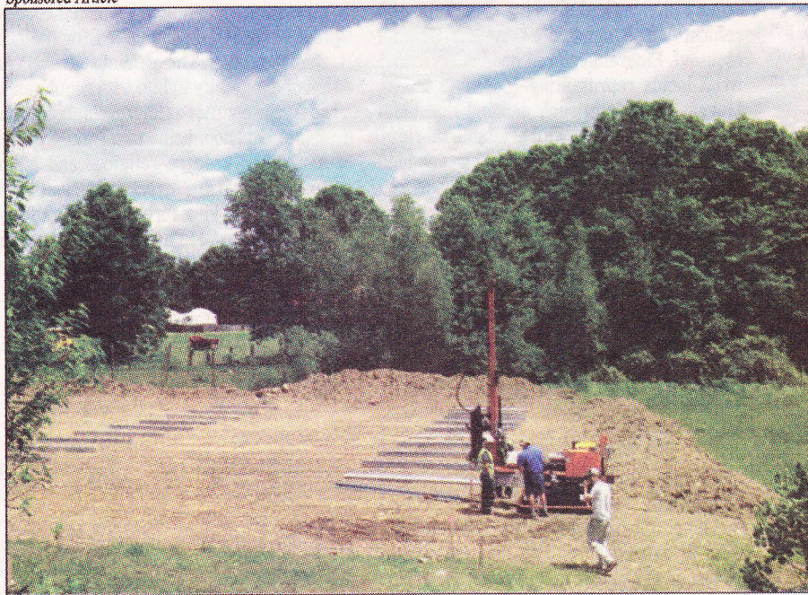
Crew prepares to drive the solar mounting system into the ground.